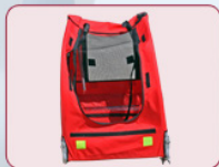
4. Raise inner bar