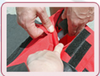
5. Line up with support