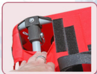
6. Lock in place with pin