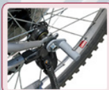
10. Bolt bike hitch