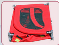
1. Lay trailer flat