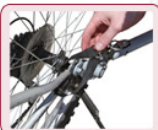
13. Attach strap