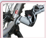
12. Lock with pin