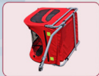
7. Flip trailer on its side