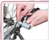
11. Slide adapter on