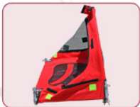
2. Fold up each side