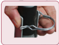
3. Lock In place with pins