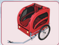
9. Align to bicycle